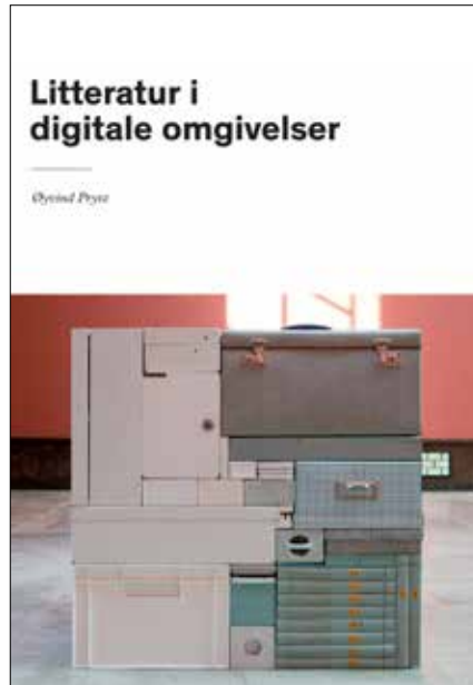
Literature in a Digital Environment Øyvind Prytz