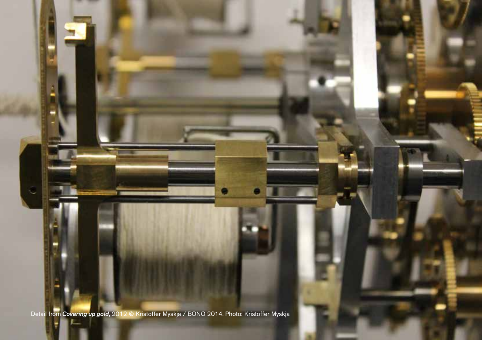
Detail from Covering up gold , 2012 © Kristoffer Myskja / BONO 2014. Photo: Kristoffer Myskja