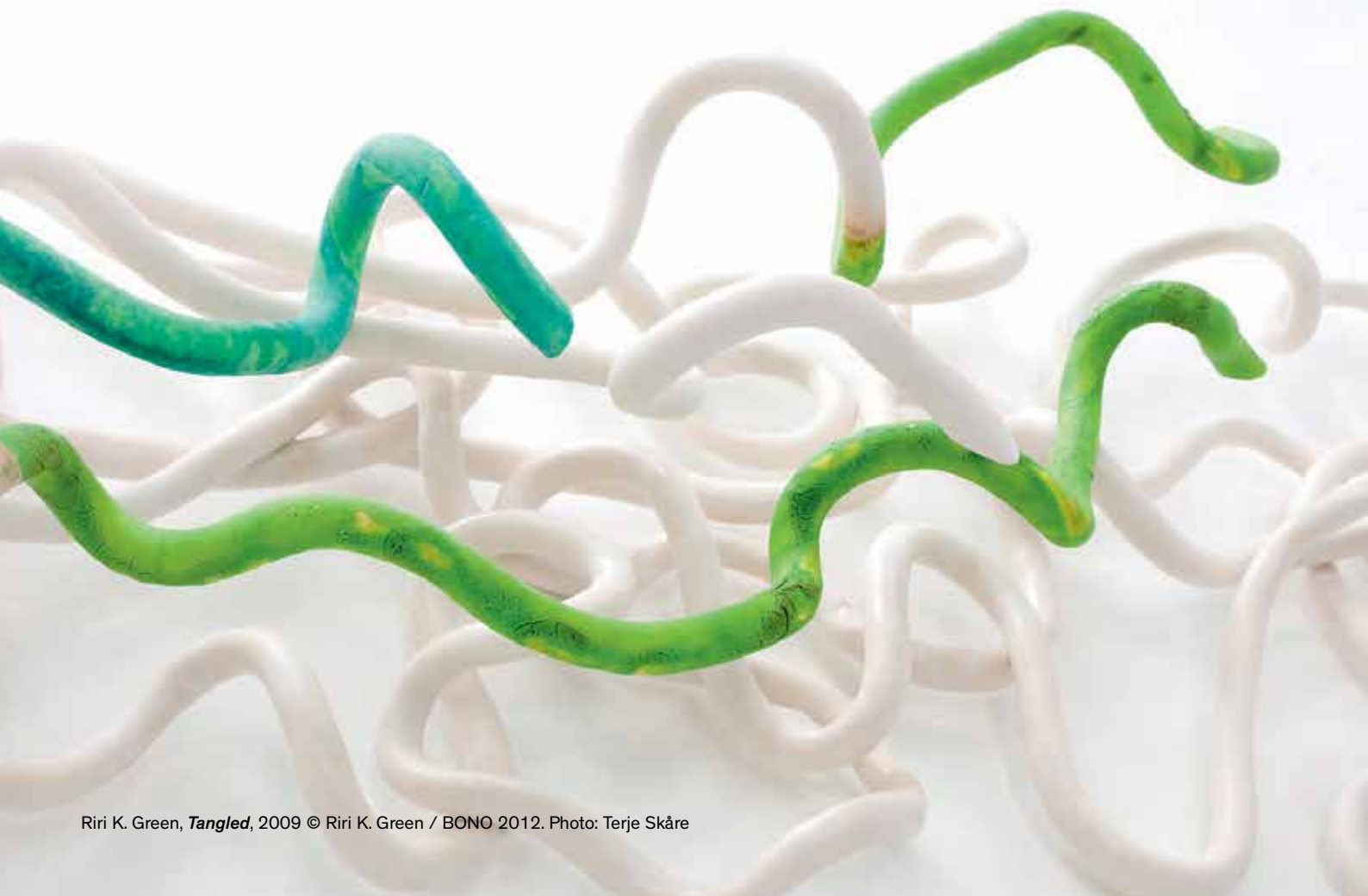
Riri K. Green, Tangled , 2009 © Riri K. Green / BONO 2012.